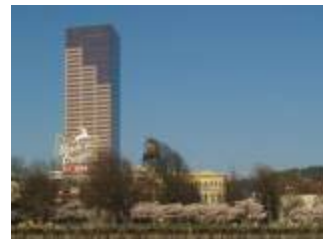
The famous White Stag sign during April’s cherry blossom on the river with “Big Pink” looking on.