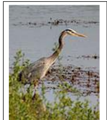
Blue Herons frequent the Willamette River early in the morning.

If you are lucky or just crazy enough to be walking early in the morning, before 7:00 am, you may see some of the birdlife that frequents the river. The city’s symbol is the Blue Heron . They stand on snags in the river or boulders at the water’s edge, waiting patiently for their breakfast to swim by, unsuspecting. Meanwhile, the Dark Cormorant , in groups of three or more, cruise the mid stream and dive for fish. Take the time to watch them as they disappear, guessing which way they have travelled to reemerge 12-18 seconds later, hopefully with