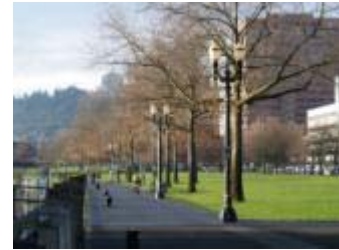
Tom McCall Riverfront Park, Portland

Upon crossing the Steel Bridge , back to the west side, you can enjoy the cherry blossoms (late March early April) which lead to the Japanese Memorial commemorating in stone and poetry, the internment of Japanese American families during WWII. It’s a favorite place for locals to relax along the tree shaded berm that is the memorial and just across the Naito Parkway from the beautifully restored White Stag Building which houses the University of Oregon