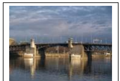
Morrison Bridge, Portland