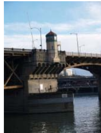
Burnside Bridge, Portland