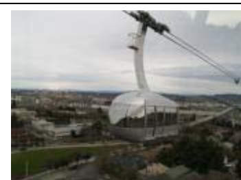
Portland Tram connects OHSU Wellness Center to the hospital complex in the West Hills