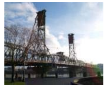
Hawthorne Bridge, Portland

As you cross the bridge, take in the sight looking south. On the Westside of the river, beyond the residential center called RiverPlace