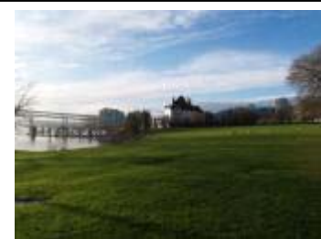
Portland “Bowl” hosts many outdoor events at the river’s edge